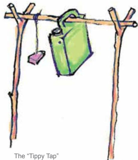
The "Tippy Tap"